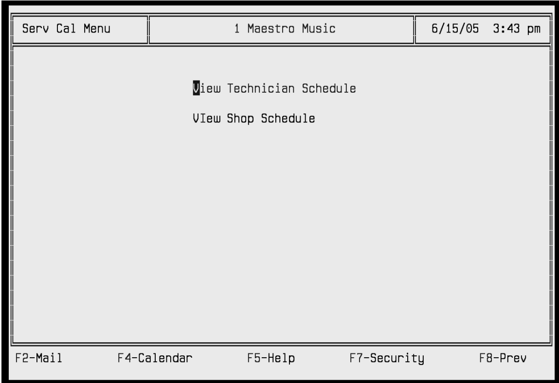
Figure 9- 1 Review Service Schedules Menu

Two options are available to view scheduled work, by the technician and by the shop. See Figure 9-1.